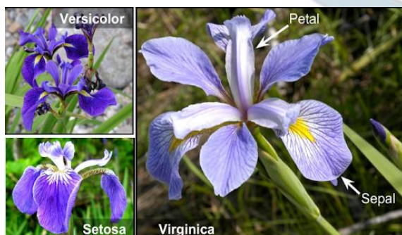
Figure 2: Iris dataset

The Iris dataset is a widely used dataset in machine learning and statistics, often employed for classification and clustering tasks. Introduced by British statistician and biologist Ronald Fisher in 1936, it consists of 150 samples of iris flowers from three species: Iris setosa, Iris versicolor, and Iris virginica. Each sample is described by four numerical features—sepal length, sepal width, petal length, and petal width—making it an excellent dataset for exploring supervised learning algorithms. Due to its small size, simplicity, and clear distinctions between classes, the Iris dataset is frequently used for educational purposes, benchmarking machine learning models, and demonstrating data visualization techniques.